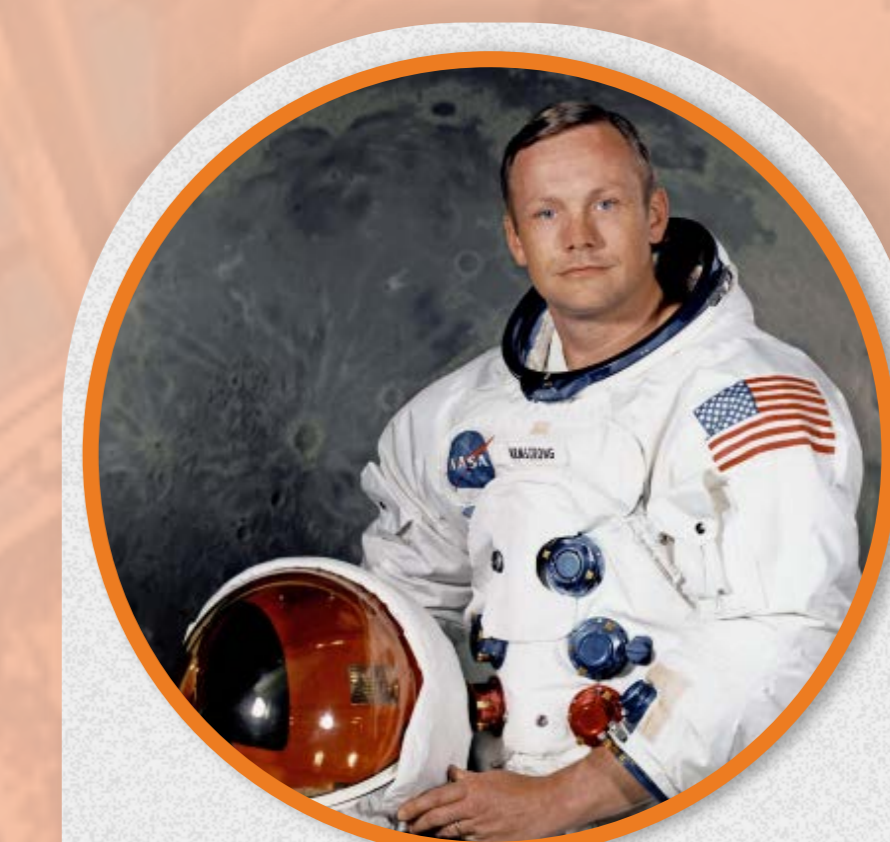
first man on the moon