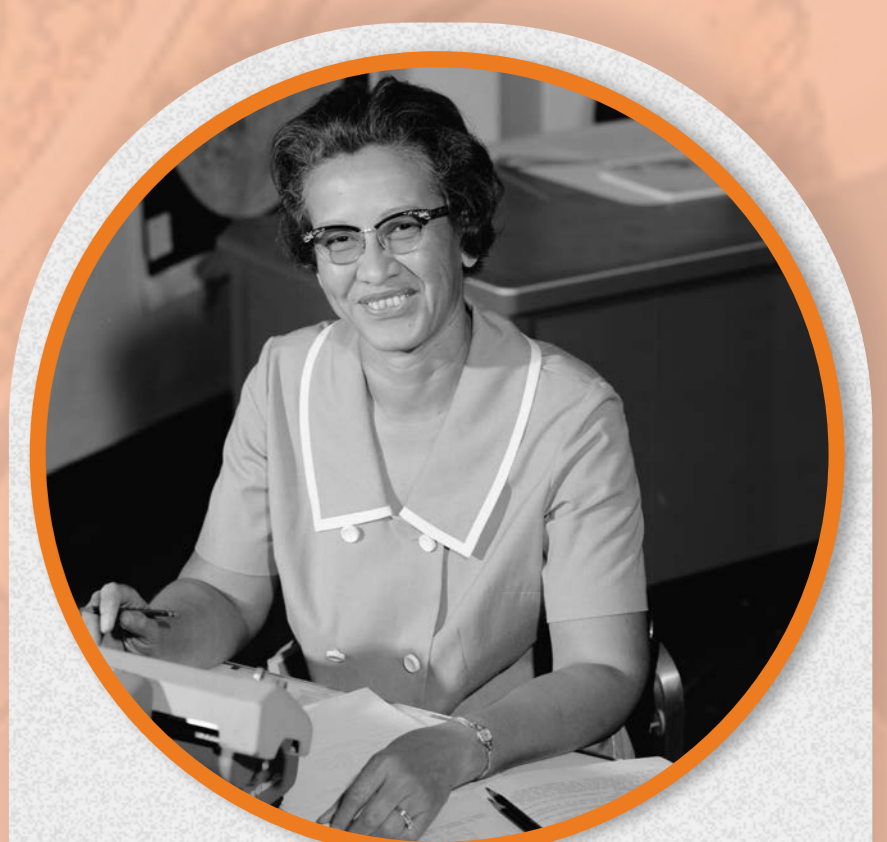
a great mathematician who worked for NASA