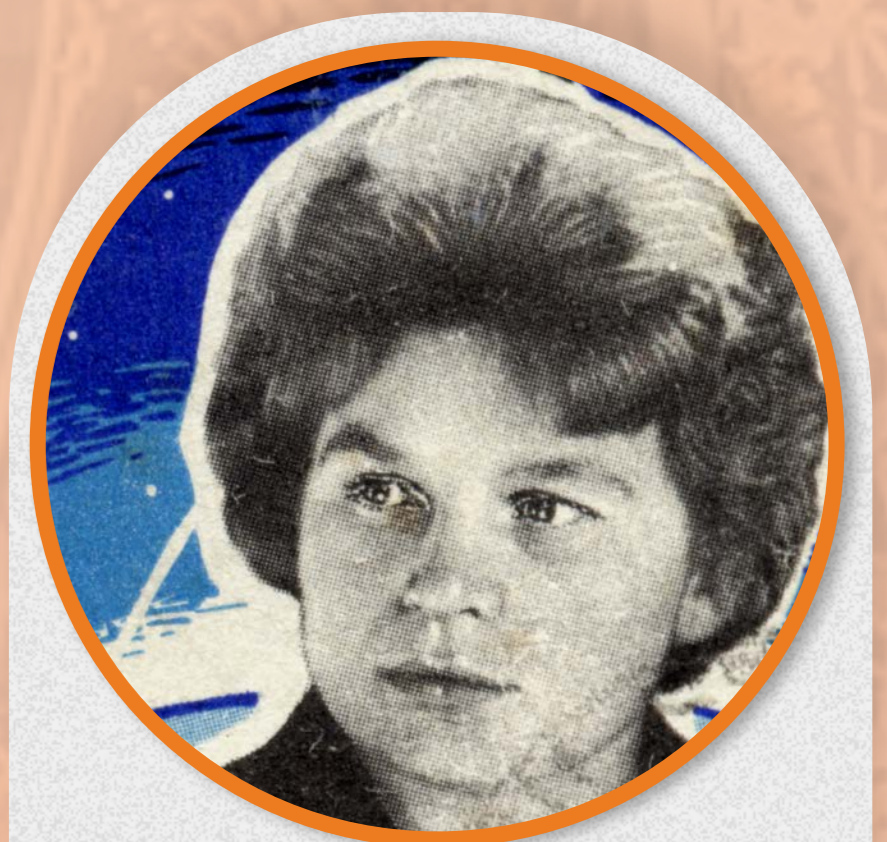
first women in space