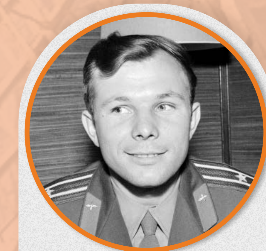
first man in space