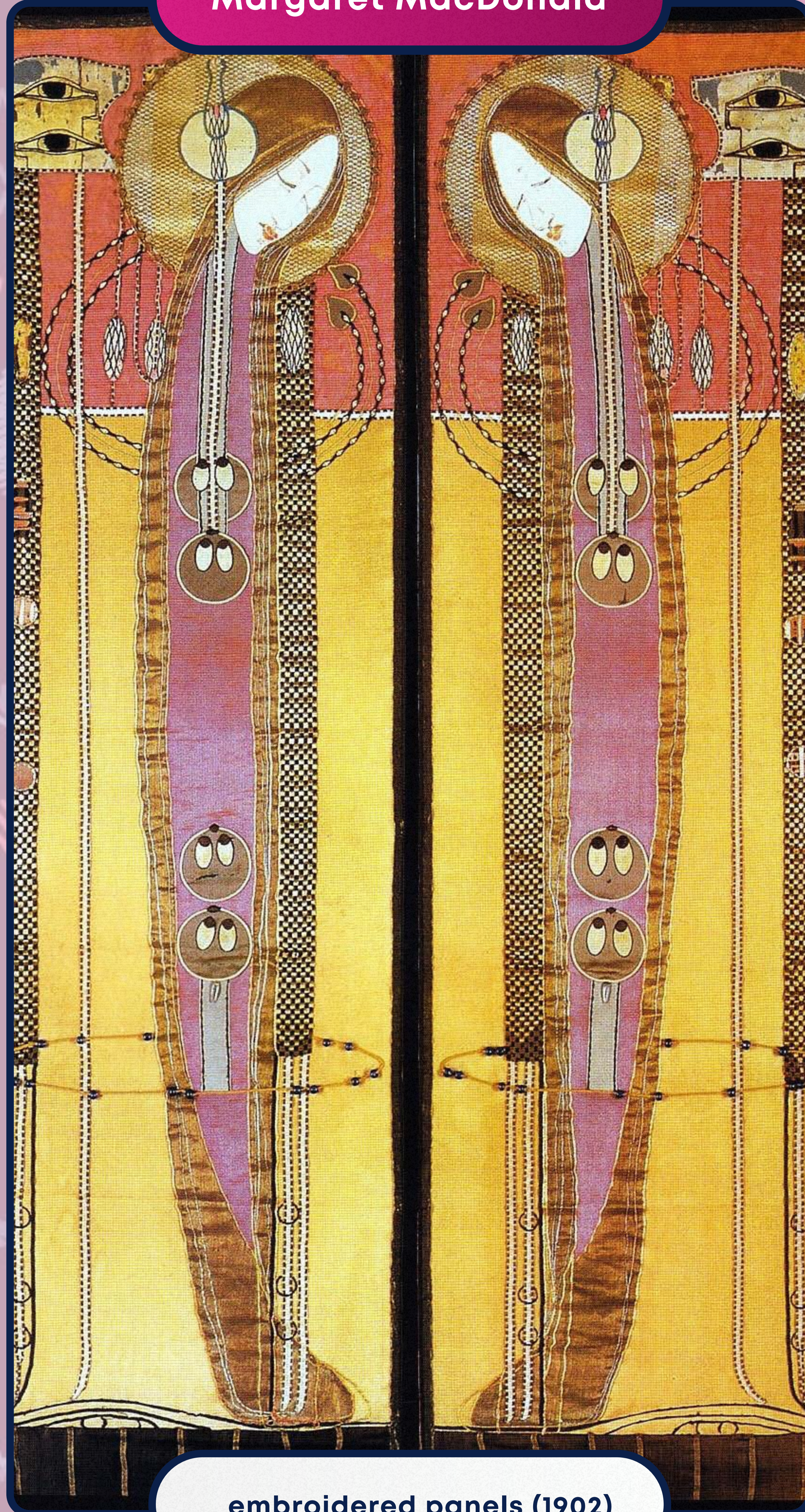
embroidered panels (1902)